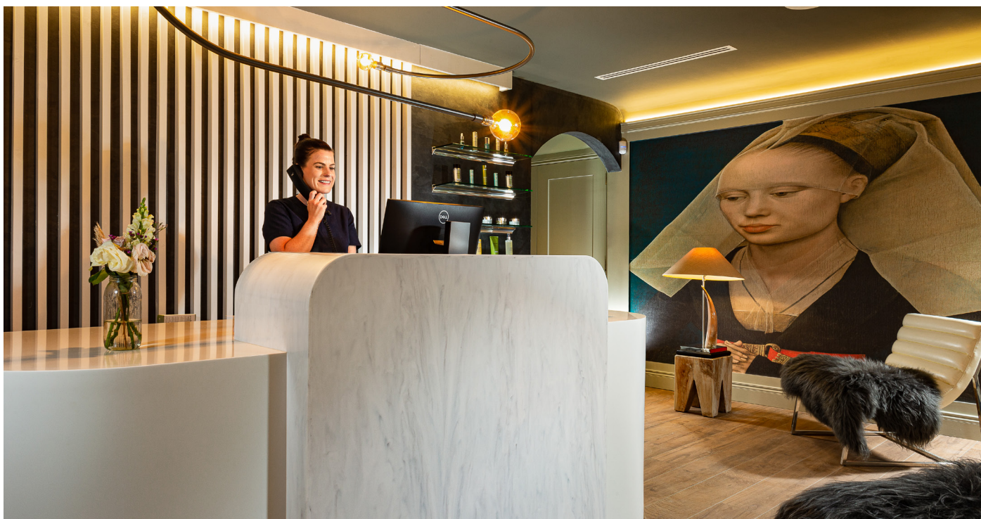
The Spa Reception

The Spa at Kilkea Castle is designed to allow a relaxing and mindful environment. We have focused on creating a unique and enriching experience to nurture the mind and body.