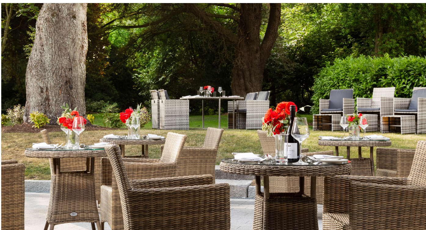
Baronial Hall Patio

Kilkea Castle is the perfect venue to gather for a Summer BBQ with colleagues, friends and family. The estate has three outdoor BBQ Venue options accommodating groups of 20 to 500 Guests. The patio overlooking the Castle Gardens or Baronial Hall allows for a sophisticated outdoor gathering while the Clubhouse Patio is a more relaxed environment.