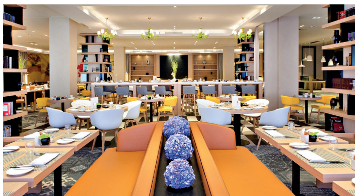
The Kitchen Gallery restaurant

COMBINATION OF MODERN DESIGN AND CLASSIC FRENCH ELEGANCE IN THE VERY HEART OF WARSAW